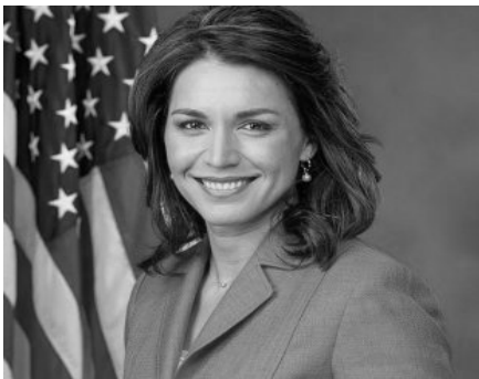
DNC barred Tulsi Gabbard from debate venue